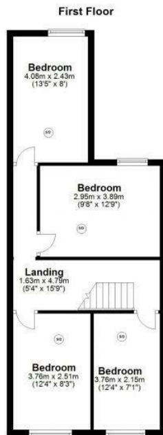
Raddlebarn Road, Birmingham